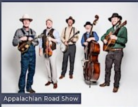
Appalachian Road Show