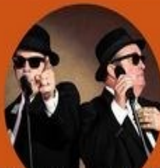
THE BLUES BROTHERS