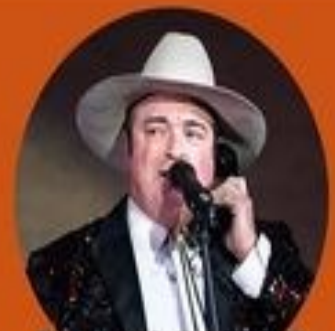
THE BIG BOPPER