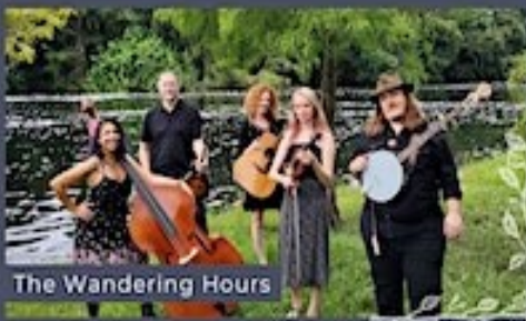
The Wandering Hours